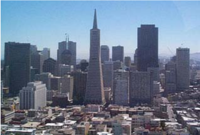
City No. 1 (San Francisco)