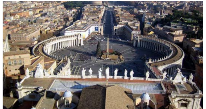
City No. 6 (The Vatican/Rome)