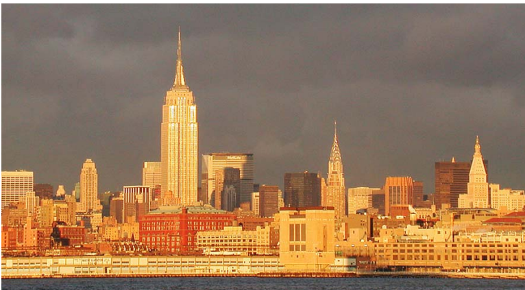
City No. 10 (New York)