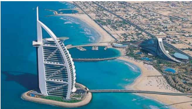
City No. 5 (Dubai)