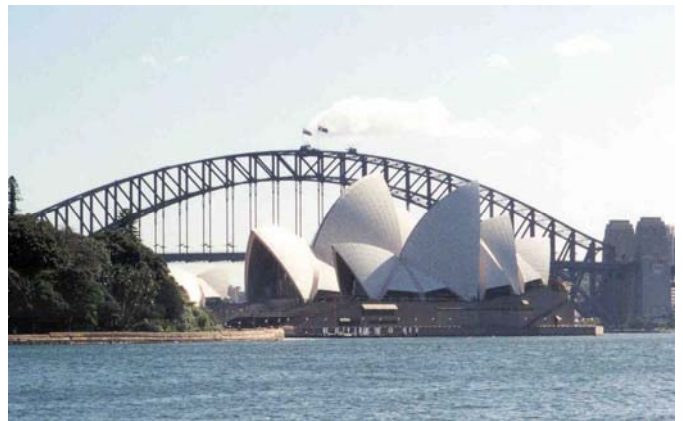
City No. 4 (Sydney)