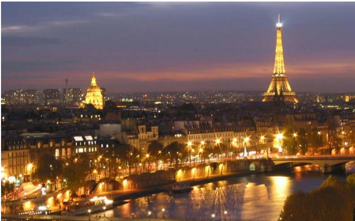
City No. 8 (Paris)