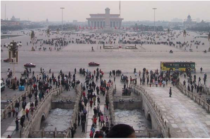
City No. 7 (Beijing)