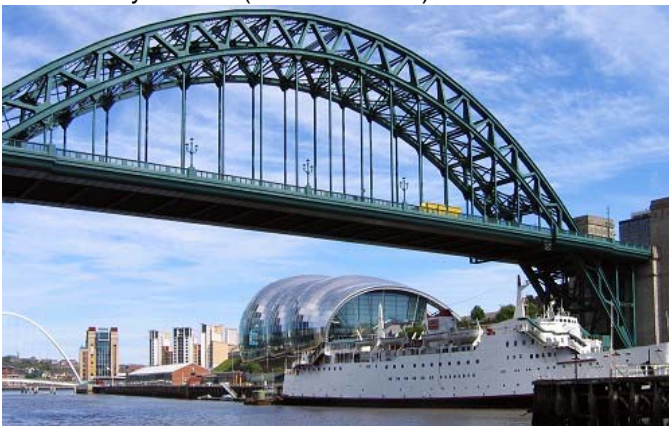
City No. 3 (Newcastle)