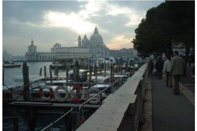
City No. 2 (Venice)