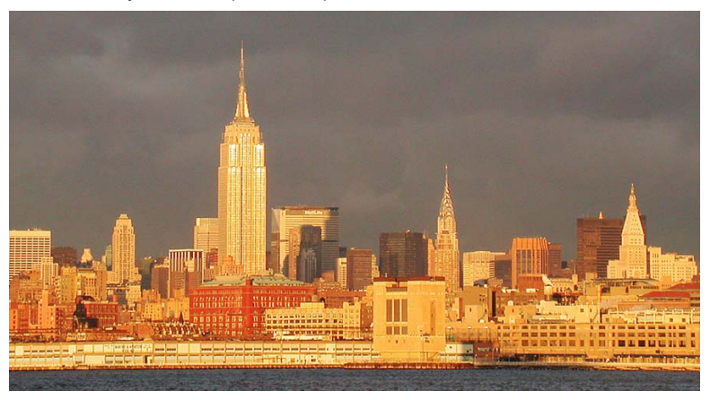
City No. 10 (New York)