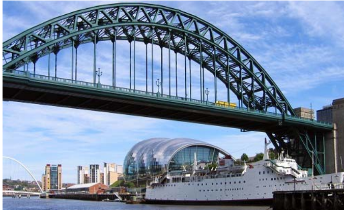
City No. 3 (Newcastle)