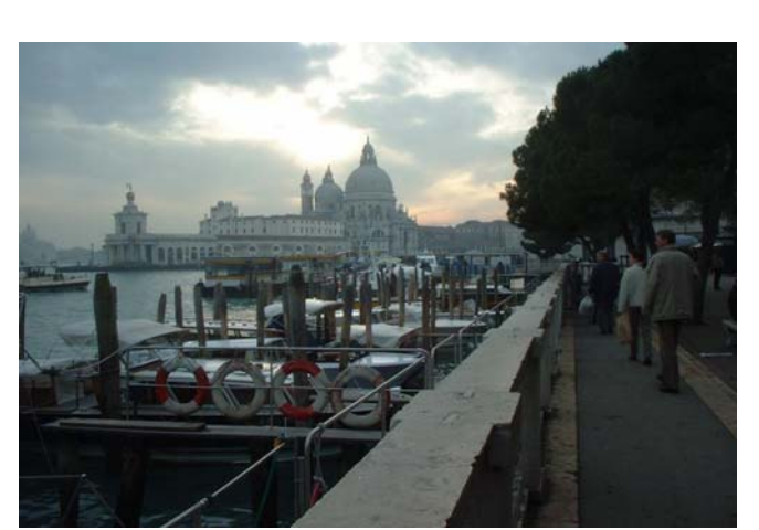
City No. 2 (Venice)