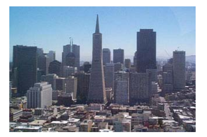
City No. 1 (San Francisco)