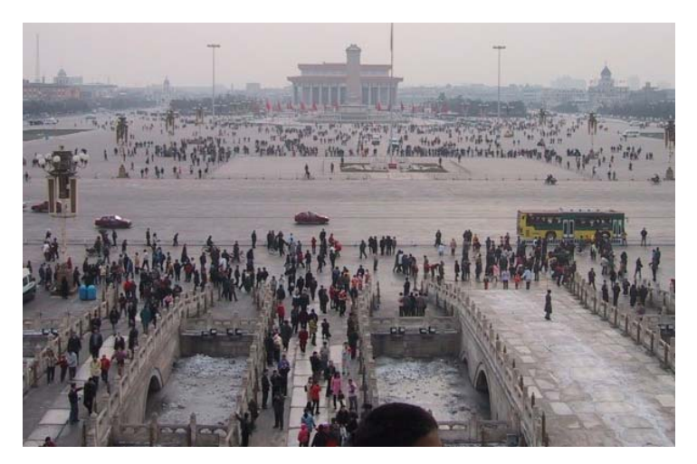
City No. 7 (Beijing)