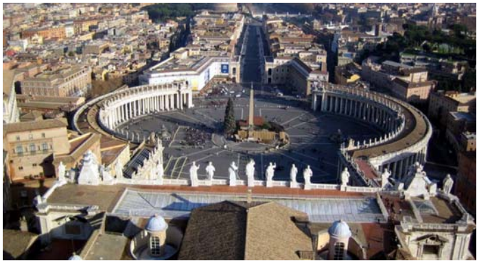
City No. 6 (The Vatican/Rome)